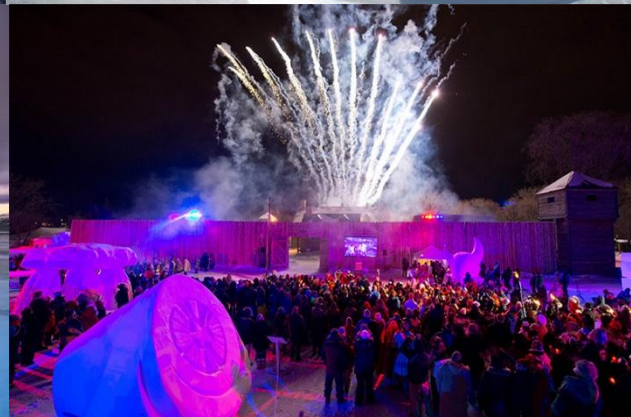
Festival du Voyageur