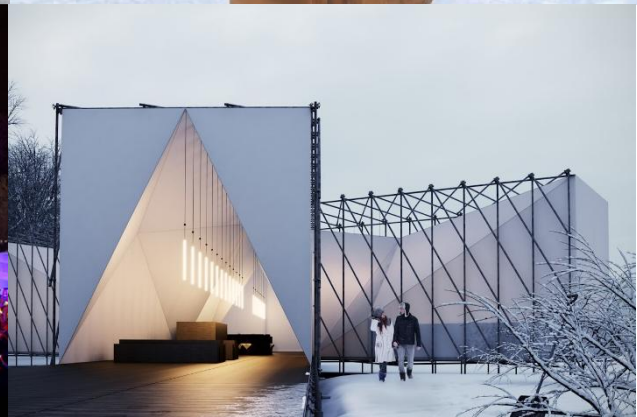
RAW: almond Restaurant