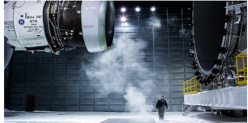
GE Aircraft engine (Engineering) at the Winnipeg facility