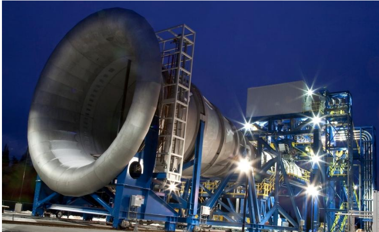
Thompson Testing facility